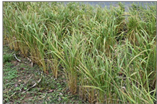
Asian Rice