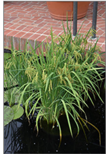
Asian Rice in bloom