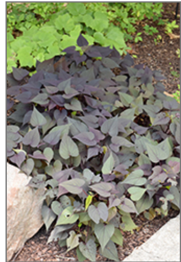
Sweet Georgia Heart Purple Sweet Potato Vine