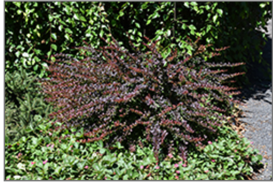
Lava Nugget Barberry

Lava Nugget Barberry is recommended for the following landscape applications;