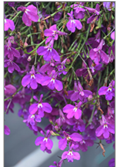
Laguna Ultraviolet Lobelia flowers