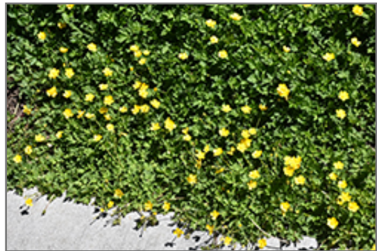
Barren Strawberry in bloom