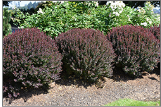
Pygmy Ruby Barberry