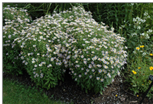
Blue Star Japanese Aster in bloom