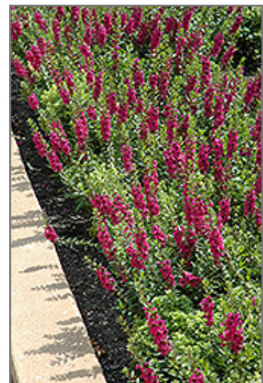
Archangel Raspberry Angelonia flowers