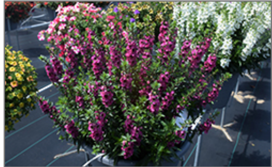
Archangel Raspberry Angelonia in bloom

* This is a 'special order' plant - contact store for details