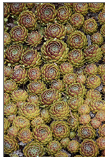
Pilioseum Hens And Chicks

Pilioseum Hens And Chicks is recommended for the following landscape applications;