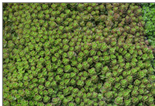
Dragon's Blood Stonecrop foliage