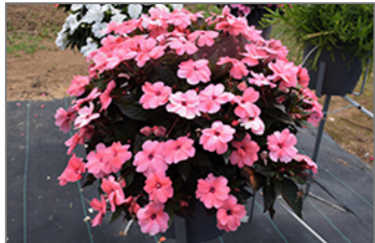
SunPatiens Compact Coral Pink New Guinea Impatiens in bloom