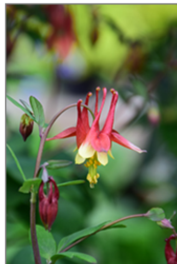
Wild Red Columbine flowers

Wild Red Columbine is recommended for the following landscape applications;