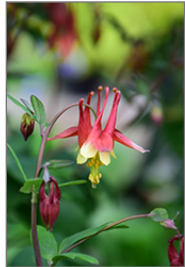
Wild Red Columbine flowers

Wild Red Columbine is recommended for the following landscape applications;