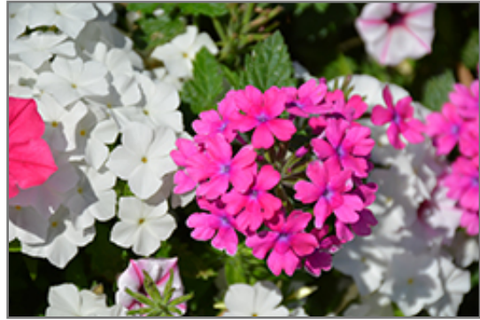
Superbena Pink Shades Verbena flowers

Superbena Pink Shades Verbena is recommended for the following landscape applications;