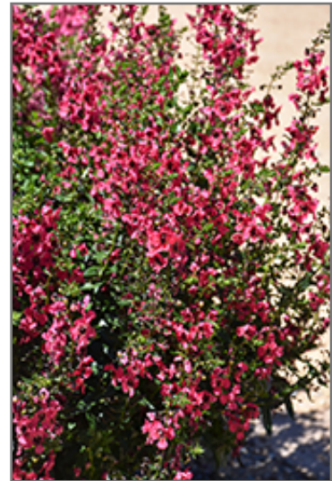
Archangel Cherry Red Angelonia flowers

Archangel Cherry Red Angelonia is an herbaceous annual with an upright spreading habit of growth. Its relatively fine texture sets it apart from other garden plants with less refined foliage.