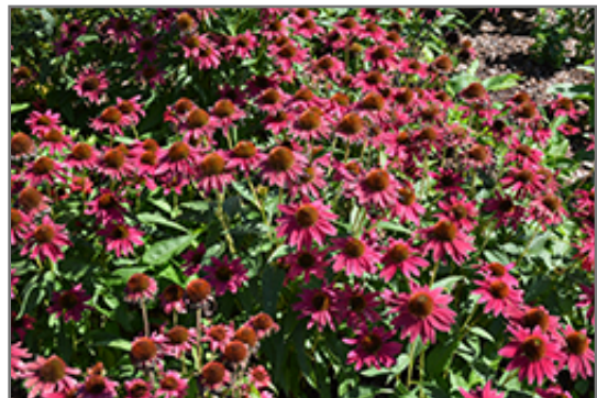
Sombrero Tres Amigos Coneflower in bloom