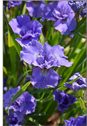
Double Standard Siberian Iris flowers