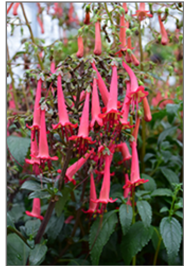
COLORBURST Deep Red Cape Fuchsia flowers