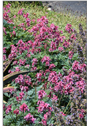
Pink Diamonds Fern-leaved Bleeding Heart flowers

Pink Diamonds Fern-leaved Bleeding Heart is an herbaceous perennial with a mounded form. It brings an extremely fine and delicate texture to the garden composition and should be used to full effect.