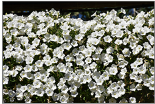
ColorRush White Petunia in bloom

ColorRush White Petunia is recommended for the following landscape applications;