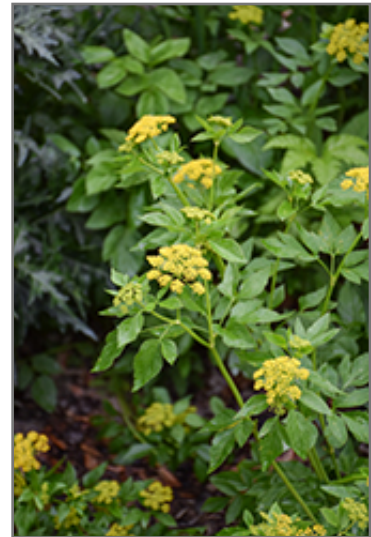
Golden Alexander flowers

Golden Alexander is recommended for the following landscape applications;