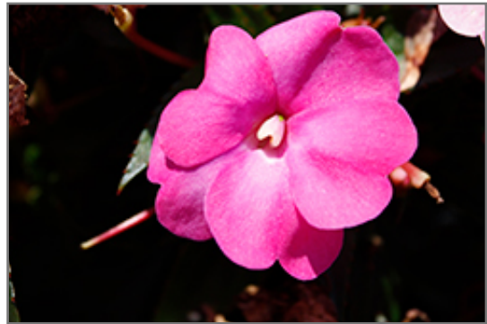
SunPatiens Compact Hot Pink New Guinea Impatiens flowers

SunPatiens Compact Hot Pink New Guinea Impatiens is recommended for the following landscape applications;