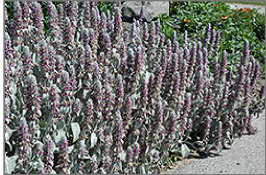
Lamb's Ears in bloom

Lamb's Ears will grow to be about 12 inches tall at maturity extending to 24 inches tall with the flowers, with a spread of 18 inches. When grown in masses or used as a bedding plant, individual plants should be spaced approximately 15 inches apart. Its foliage tends to remain dense right to the ground, not requiring facer plants in front. It grows at a fast rate, and under ideal conditions can be expected to live for approximately 10 years. As an herbaceous perennial, this plant will usually die back to the crown each winter, and will regrow from the base each spring. Be careful not to disturb the crown in late winter when it may not be readily seen!