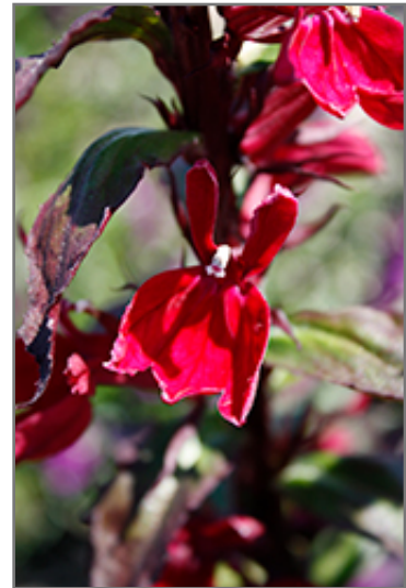
Starship Burgundy Lobelia flowers

Starship Burgundy Lobelia is recommended for the following landscape applications;