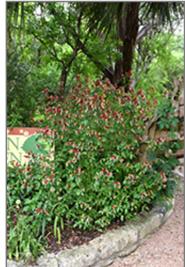
Fruit Cocktail Shrimp Plant in bloom