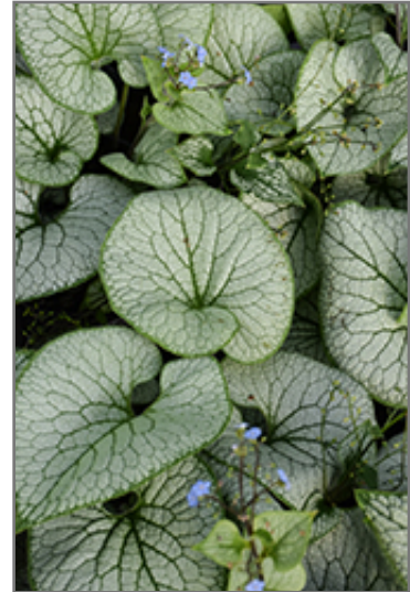
Sterling Silver Bugloss foliage

Sterling Silver Bugloss is a fine choice for the garden, but it is also a good selection for planting in outdoor pots and containers. It is often used as a 'filler' in the 'spiller-thriller-filler' container combination, providing a mass of flowers and foliage against which the thriller plants stand out. Note that when growing plants in outdoor containers and baskets, they may require more frequent waterings than they would in the yard or garden.