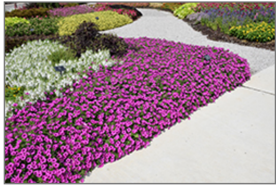
Supertunia Vista Jazzberry Petunia in bloom

Supertunia Vista Jazzberry Petunia is a fine choice for the garden, but it is also a good selection for planting in outdoor containers and hanging baskets. Because of its trailing habit of growth, it is ideally suited for use as a 'spiller' in the 'spiller-thriller-filler' container combination; plant it near the edges where it can spill gracefully over the pot. It is even sizeable enough that it can be grown alone in a suitable container. Note that when growing plants in outdoor containers and baskets, they may require more frequent waterings than they would in the yard or garden.