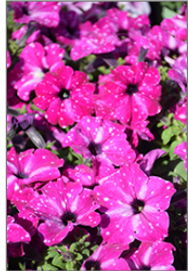
Headliner Enchanted Sky Petunia flowers

Headliner Enchanted Sky Petunia is recommended for the following landscape applications;