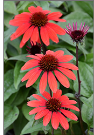
Panama Red Coneflower flowers

Panama Red Coneflower will grow to be about 10 inches tall at maturity extending to 14 inches tall with the flowers, with a spread of 10 inches. Its foliage tends to remain low and dense right to the ground. It grows at a medium rate, and under ideal conditions can be expected to live for approximately 10 years. As an herbaceous perennial, this plant will usually die back to the crown each winter, and will regrow from the base each spring. Be careful not to disturb the crown in late winter when it may not be readily seen!