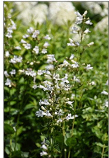
Foxglove Beardtongue flowers

Foxglove Beardtongue is recommended for the following landscape applications;