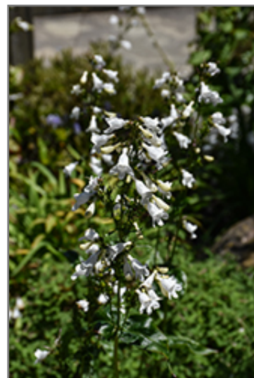
Foxglove Beardtongue flowers

Foxglove Beardtongue is recommended for the following landscape applications;