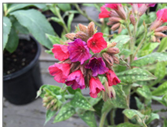
Lisa Marie Lungwort flowers