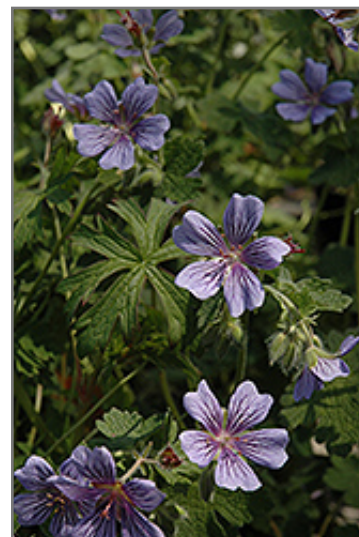
Brookside Cranesbill flowers

Brookside Cranesbill is recommended for the following landscape applications;