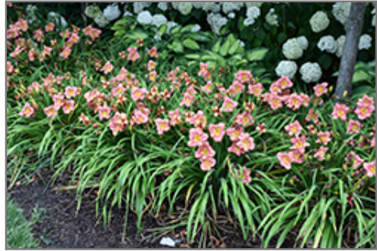
Happy Ever Appster Rosy Returns Daylily in bloom

Happy Ever Appster Rosy Returns Daylily is a fine choice for the garden, but it is also a good selection for planting in outdoor pots and containers. It is often used as a 'filler' in the 'spiller-thriller-filler' container combination, providing a mass of flowers against which the thriller plants stand out. Note that when growing plants in outdoor containers and baskets, they may require more frequent waterings than they would in the yard or garden.