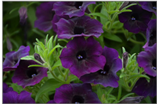
Supertunia Mini Vista Midnight Petunia flowers

This plant will require occasional maintenance and upkeep. Trim off the flower heads after they fade and die to encourage more blooms late into the season. It is a good choice for attracting butterflies and hummingbirds to your yard, but is not particularly attractive to deer who tend to leave it alone in favor of tastier treats. It has no significant negative characteristics.