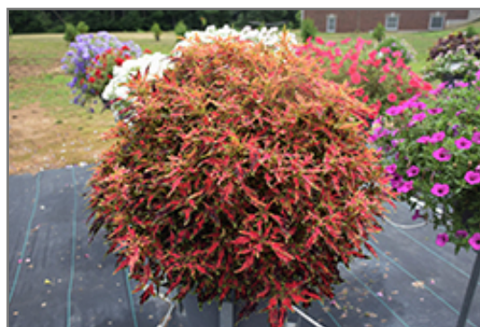
ColorBlaze Mini Me Watermelon Coleus