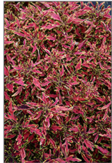
ColorBlaze Mini Me Watermelon Coleus foliage

ColorBlaze Mini Me Watermelon Coleus is a fine choice for the garden, but it is also a good selection for planting in outdoor containers and hanging baskets. It is often used as a 'filler' in the 'spiller-thriller-filler' container combination, providing a canvas of foliage against which the larger thriller plants stand out. Note that when growing plants in outdoor containers and baskets, they may require more frequent waterings than they would in the yard or garden.