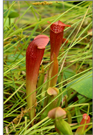
Bug Bat Pitcher Plant