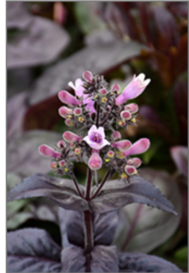
Dakota Burgundy Beard Tongue flowers

Dakota Burgundy Beard Tongue is an herbaceous perennial with an upright spreading habit of growth. Its medium texture blends into the garden, but can always be balanced by a couple of finer or coarser plants for an effective composition.