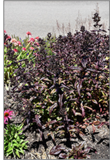
Dakota Burgundy Beard Tongue

Dakota Burgundy Beard Tongue is a fine choice for the garden, but it is also a good selection for planting in outdoor pots and containers. With its upright habit of growth, it is best suited for use as a 'thriller' in the 'spiller-thriller-filler' container combination; plant it near the center of the pot, surrounded by smaller plants and those that spill over the edges. Note that when growing plants in outdoor containers and baskets, they may require more frequent waterings than they would in the yard or garden.