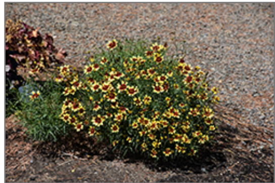
Sunstar Gold Tickseed in bloom