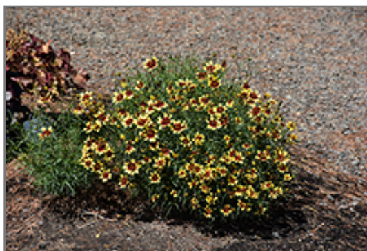
Sunstar Gold Tickseed in bloom