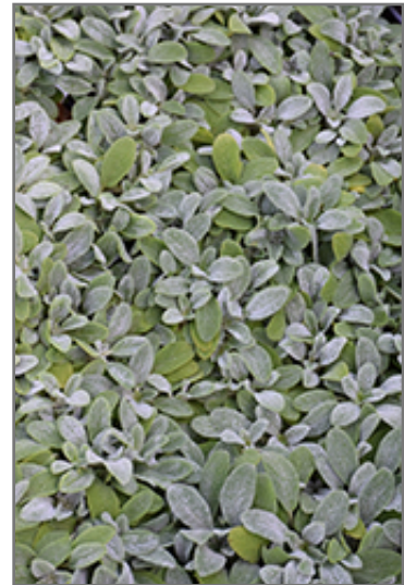
Little Lamb Lamb's Ears foliage

Little Lamb Lamb's Ears is recommended for the following landscape applications;