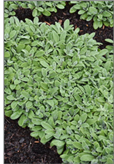
Little Lamb Lamb's Ears

* This is a 'special order' plant - contact store for details