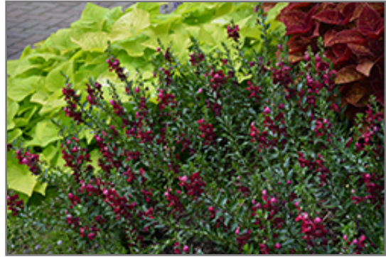
Archangel Ruby Sangria Angelonia in bloom

* This is a 'special order' plant - contact store for details