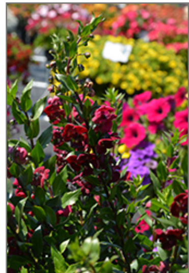
Archangel Ruby Sangria Angelonia flowers