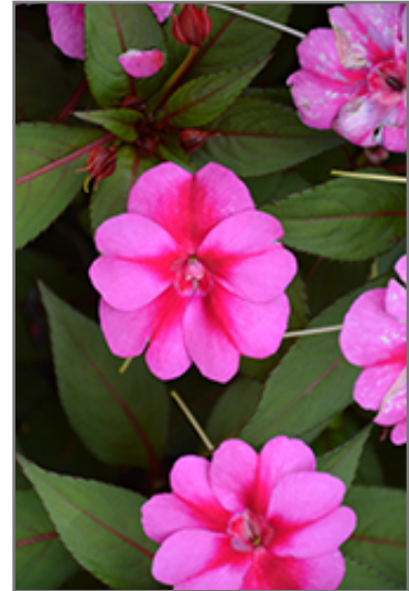
SunPatiens Compact Purple Candy Impatiens flowers

SunPatiens Compact Purple Candy Impatiens is recommended for the following landscape applications;