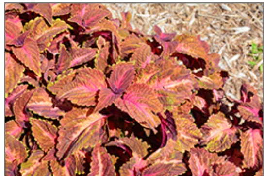
Main Street Sunset Boulevard Coleus foliage