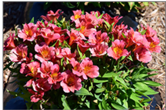
Eliane Alstroemeria in bloom