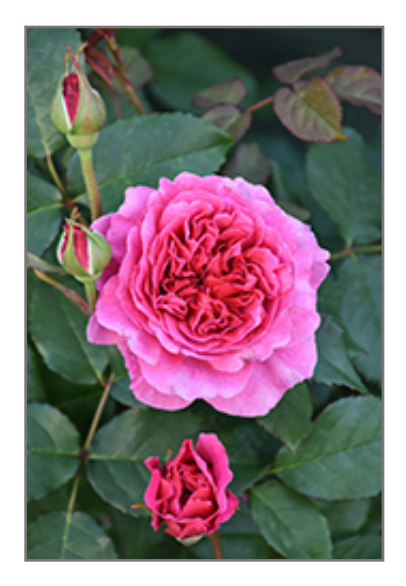
Gabriel Oak Rose flowers