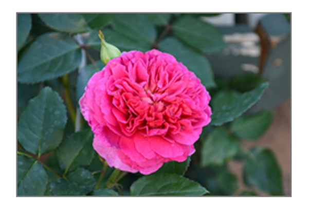
Gabriel Oak Rose flowers