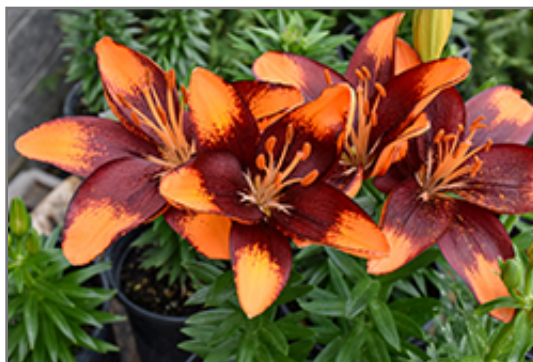
Lily Looks Tiny Lion Lily flowers