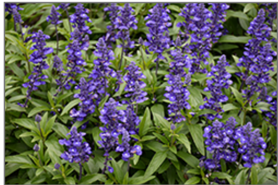
Sallyfun Blue Lagoon Salvia flowers