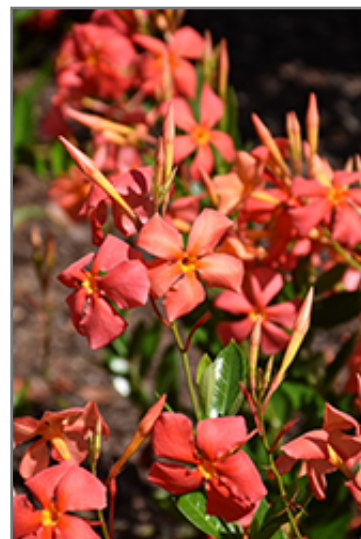
Sun Parasol Fired Up Mandevilla flowers

This plant does best in full sun to partial shade. It requires an evenly moist well-drained soil for optimal growth. It is not particular as to soil type or pH. It is highly tolerant of urban pollution and will even thrive in inner city environments. This particular variety is an interspecific hybrid, and parts of it are known to be toxic to humans and animals, so care should be exercised in planting it around children and pets. It can be propagated by cuttings; however, as a cultivated variety, be aware that it may be subject to certain restrictions or prohibitions on propagation.