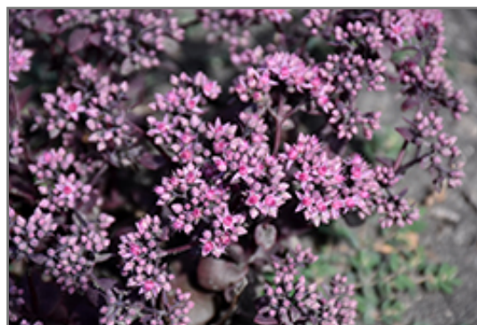
Red Carpet Stonecrop flowers