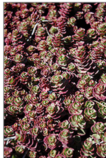
Red Carpet Stonecrop foliage

This plant will require occasional maintenance and upkeep, and is best cleaned up in early spring before it resumes active growth for the season. Deer don't particularly care for this plant and will usually leave it alone in favor of tastier treats. Gardeners should be aware of the following characteristic(s) that may warrant special consideration;