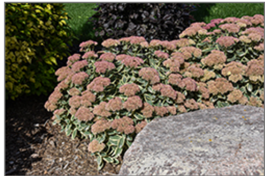
Autumn Charm Stonecrop in bloom